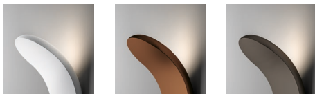
BC Wrinkled white