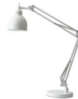
Matt white: art.no. 100887