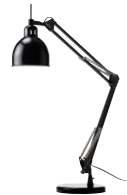
Matt black: art.no. 100885