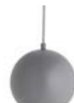
Matt light grey. Art.no. 100184 Grey fabric cord