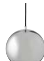
Glossy chrome. Art.no. 100188 Black fabric cord