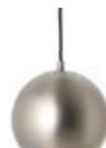
Brushed Satin. Art.no. 100186 Black fabric cord