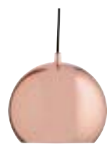
Glossy copper. Art.no. 100175 Black fabric cord