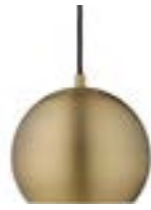
Matt antique brass. Art.no. 100167 Black fabric cord