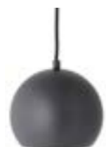
Matt dark grey. Art.no. 100165 Black fabric cord