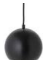
Matt black. Art.no. 100193 Black fabric cord