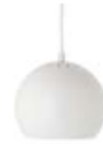
Matt white. Art.no. 100194 White fabric cord