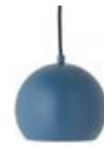
Matt petrol blue. Art.no. 100164 Black fabric cord